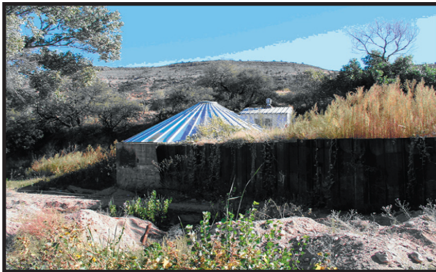
Figure 5. A natural spring that has been renovated and pooled