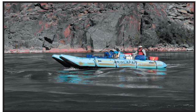
Figure 2. Hualapai River Runners rafting service on the Colorado River

In addition, heavier sediment loads in the river and sandbar collisions damaged 40-50 motors in 2004 at a cost of $4,000-$5,000 each. Several pontoons were also damaged at a cost of $10,000 each. An interview participant reported that the drought had caused an estimated five percent increase in total operating costs. Of course, not all losses during drought are economic. Interview participants also stated a number of anecdotal negative effects on wetlands, springs, riparian habitat, wildlife, and individuals, which can never be truly calculated.