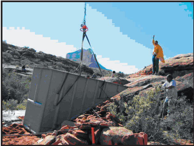
Figure 6. Installing remote wildlife “drinkers” by helicopter in 2005