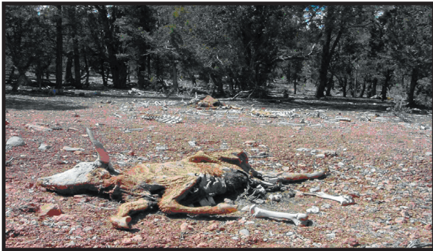
Figure 1. Cattle deaths in 2002 on the eastern portion of the Hualapai Reservation