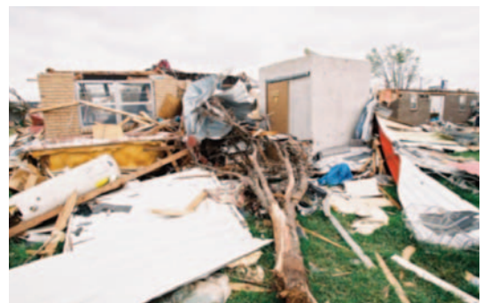
Storm shelters and safe rooms really work.