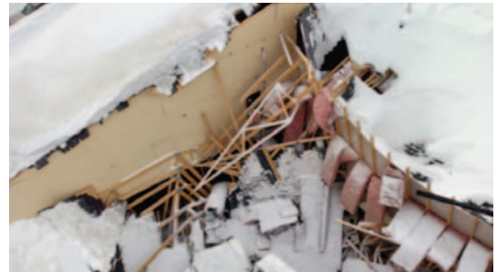
In many instances roof collapse due to snow loads not only results in damage to roof and building contents below but may also remove lateral support, allowing walls to collapse.