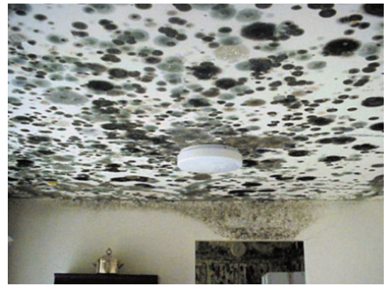
Organic building materials provide a food source for mold and mildew in building.

In addition to the more stringent requirements of the local code or the IBC C , for the use of smooth, hard, non-absorbent, surrounding surfaces, the requirements for high performance should be augmented. The surface of floors and wall base material, extending upward on the at least 6 inches, should be smooth, hard, and nonabsorbent in all toilet, bathing and shower rooms; kitchens; laundries; and spa areas. Smooth, hard, non-absorbent surfaces might also be considered to reduce maintenance and repair in highly trafficked areas such as corridors, especially those in educational facilities.