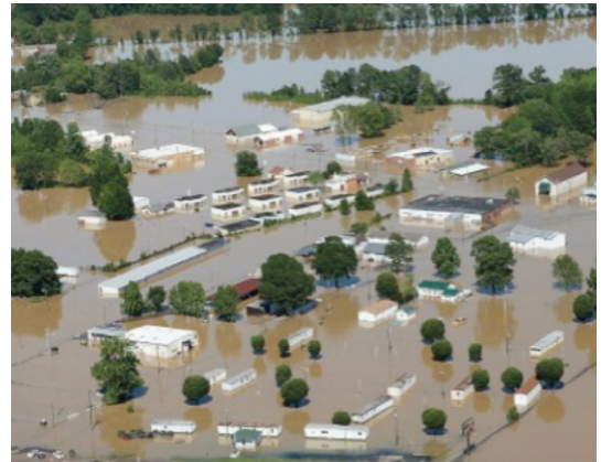
Flooding not only damages, but typically contaminates building materials and contents rendering them unusable and requiring incineration or disposal in landfills.

To date most sustainability or green voluntary certification programs, codes, and standards have focused primarily on energy, material, and water conservation; indoor environmental quality; and site selection and development. Each of these is an important aspect of sustainable building design and construction. However, the assumption that the basic building will be functionally resilient is not inherent in these programs. Often minimum requirements in many building codes are focused on life safety and do not provide the protection of buildings and their contents necessary for truly sustainable buildings. Unfortunately, this is consistent with our disposable-mentality and often results in buildings that satisfy the absolute minimum project requirements at the least possible initial cost. Even today, many jurisdictions do not have a building code or the building code may not be applicable to all building occupancies.