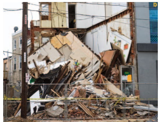
Enhanced resilience lends to reusing or even re-purposing rather than disposal due to premature collapse.