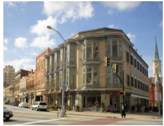
Robust, resilient buildings are frequently reused and even re-purposed when downtowns are renovated.

Discussion on intent is provided with specific design and construction recommendations. Resources are cited in the end notes to this document.