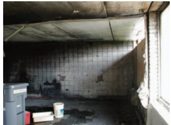
Fire resistant non-combustible materials contain fires minimizing fire and smoke damage. This damage resistance allows portions of the buildings to simply be cleaned, painted and reoccupied rather than completely re-constructed.