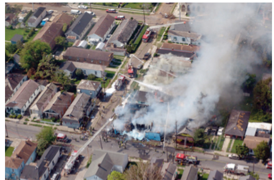
Conflagrations from building fires jeopardize communities. For example a dormitory under construction at Virginia Commonwealth University (not depicted here) burnt to the ground and spread fire to 28 surrounding buildings.