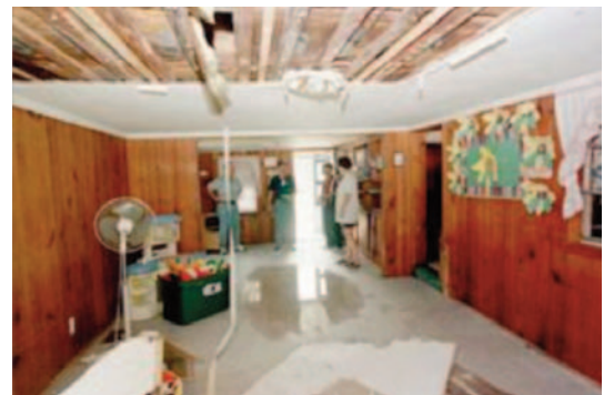
Moisture damage is not just related to flooding. Here, an inspector is seen evaluating water damage when a roof was compromised by wind and rain.