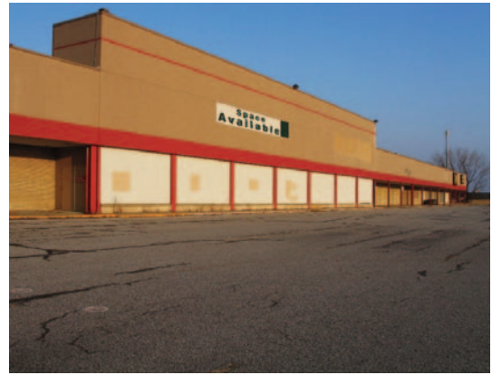
Design of buildings should appropriately consider long-term community development plans to help assure buildings can be re-used or re-purposed.