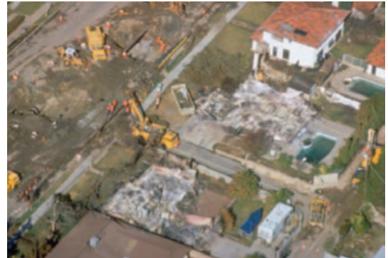
A magnitude 6.7 earthquake caused 72 deaths and destroyed or damaged 114,000 residential and commercial buildings. The direct cost of damage alone was estimated by FEMA to be 25 billion dollars.