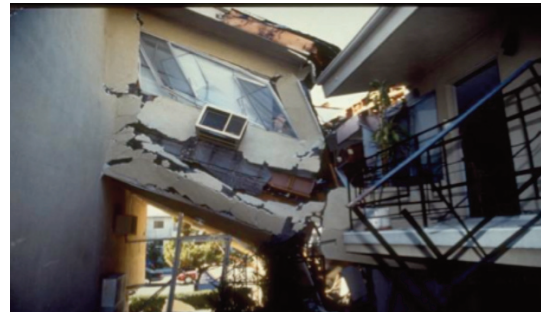
Earthquake damage to personal property.

Design and Construction A,G,H,M - Storm shelters complying with the requirements of ICC 500 H should be provided for occupants of all sustainable buildings in hurricane-prone and tornado-prone areas where the shelter design wind speed is 160 mph or more. When combined hurricane and tornado shelters are needed the more stringent requirements of ICC 500 H should be used.