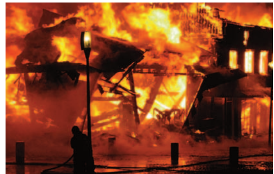
Without power or water supplies after disasters, individuals resort to open fires for light, heating, cooking and purifying water. Such open fires are often not properly contained furthering the potential for even greater disasters.