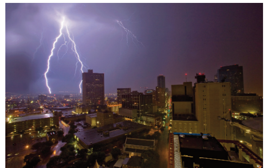
While typical building codes and standards are based on previous weather events and disasters, the National Weather Service is advising that due to global warming we should expect more extreme and severe weather.