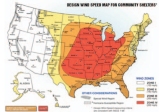
Design Wind Speed Map for Community Shelters

FEMA advises that the storm shelter at this high school will provide near absolute protection for more than 2,000 people in the event of a hurricane or tornado.