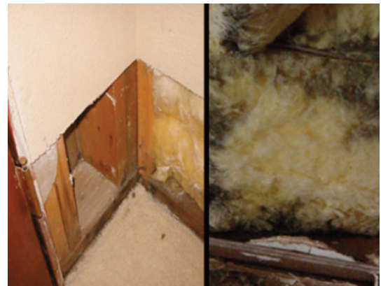
Hard, smooth, nonabsorbent surfaces in areas prone to water exposure can prevent damage to adjacent areas and hidden components.