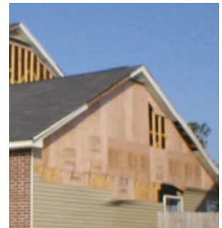
Damage to siding and sheathing as a result of high winds.

Topography, vegetative fuels and drought contribute to the potential for devastating wildfires.