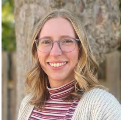
Carson MacPherson-Krutsky Natural Hazards Center