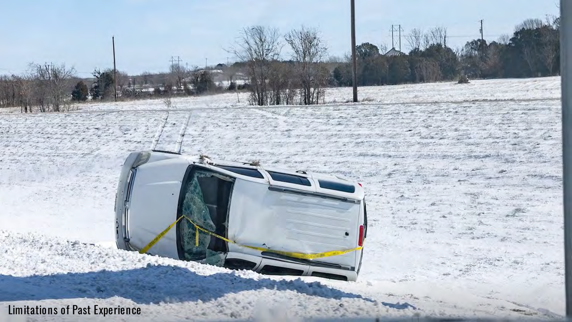
Limitations of Past Experience