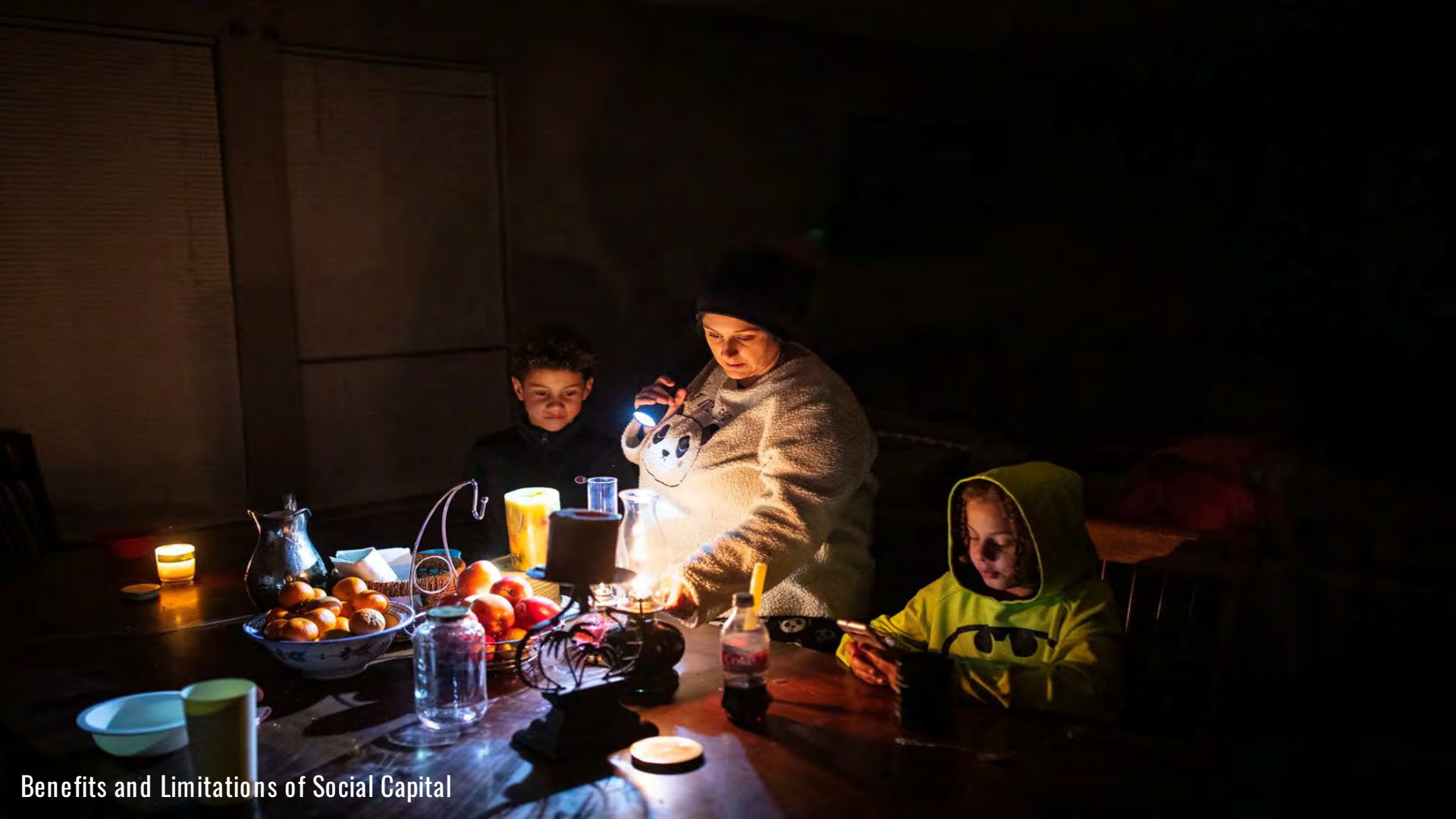
Benefits and Limitations of Social Capital