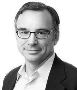
Rob Moore Natural Resources Defense Council