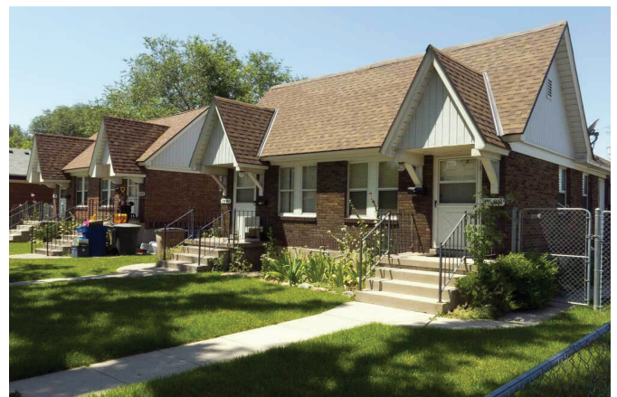
Public housing residents in Salt Lake County could be without permanent homes after a large-scale disaster, such as an earthquake.

This research examines the challenges and opportunities of pre-disaster planning for public housing recovery using the case study of Salt Lake County, Utah, which could experience a high-magnitude earthquake in the next 50 years but has not experienced one in recent history. Methods for this study included analyzing seven public housing plans, eight hazard mitigation plans, two disaster preparedness plans, and four disaster response plans adopted by Salt Lake County and its 16 constituent cities as the archival research. Ten semi-structured, open-ended key informant interviews were then conducted with public officials. Study findings show that in pre-disaster planning for public housing recovery is challenged by organizational and funding capacity, leadership, and lack of trust. It can, however, be promoted through the creative use of financing, public education, joint action plans, and using smaller-scale disasters to catalyze