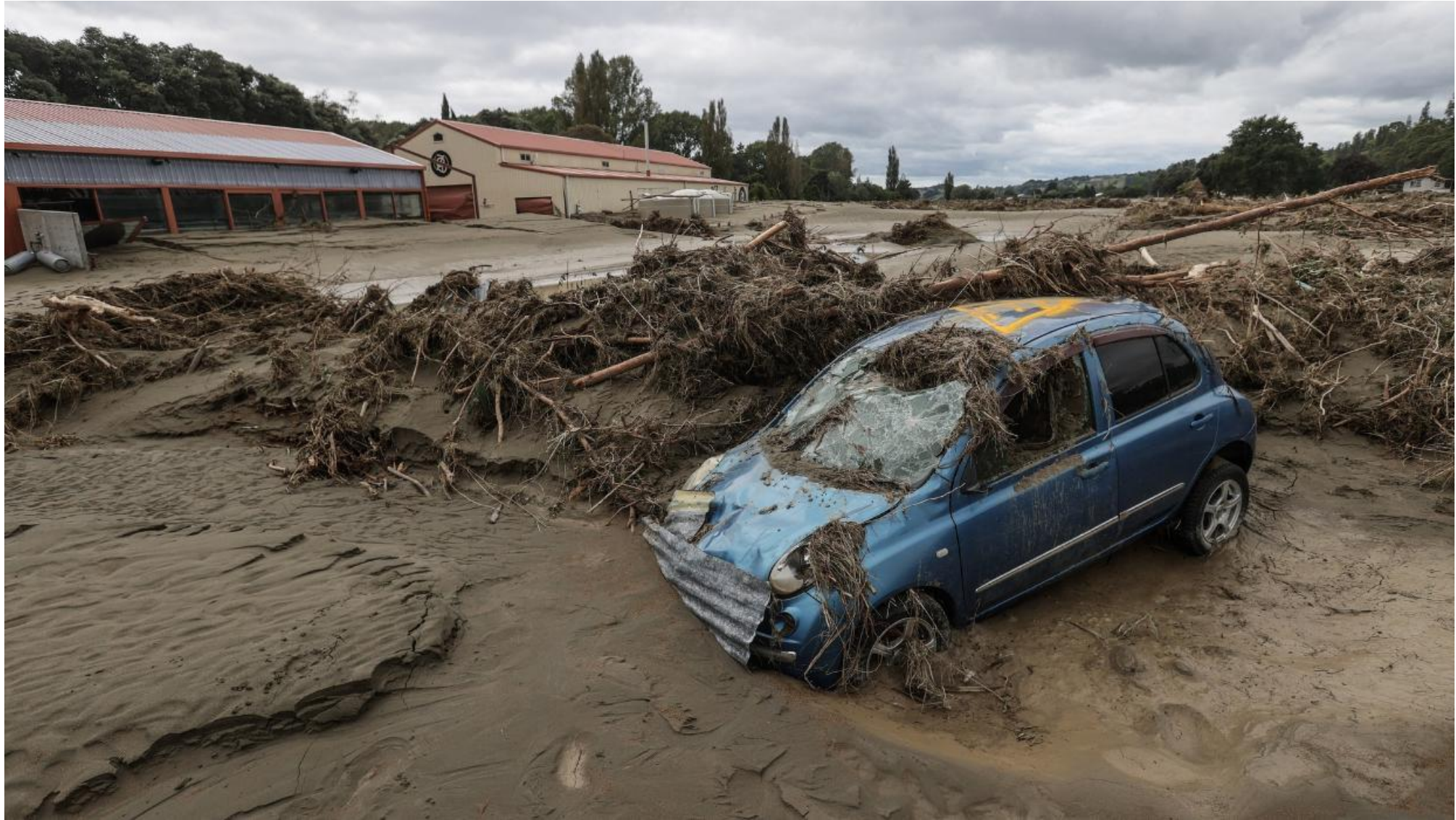
Esk Valley, Cyclone Gabrielle, 2023