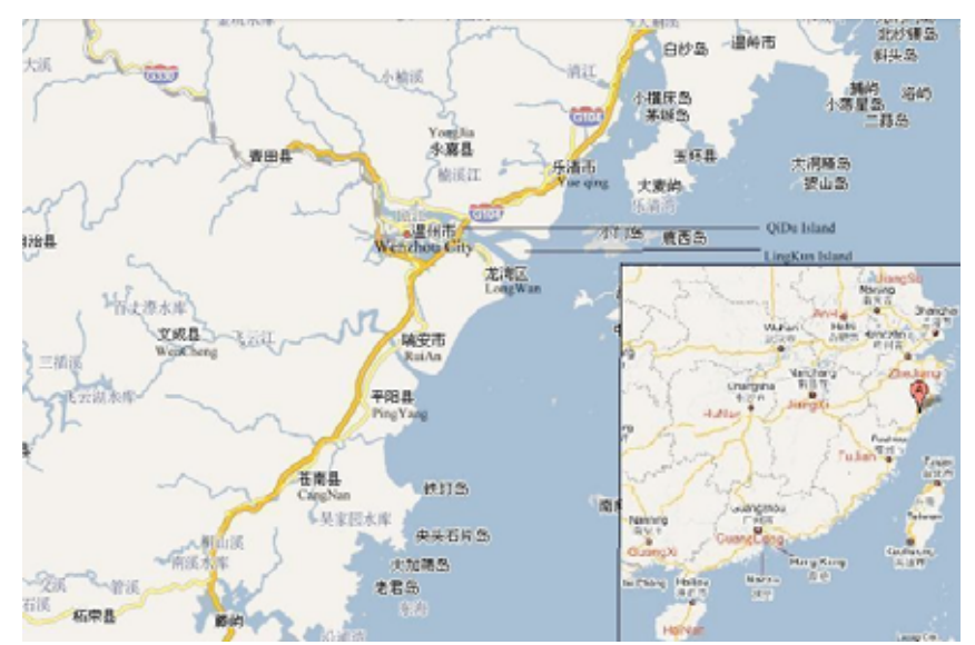
Figure 1 Typhoon vulnerable provinces in China and location of Wenzhou City

Among the coastal cities, Wenzhou city is one of the most frequently affected areas [see the geographical position of Wenzhou and typhoon prone areas in China in Figure 1]. Wenzhou is a city located on a small plane with hills in its western and northern regions<sup>2</sup>. The population is 7.6 million [2007], of which the urban population is 1.4million [not including peasant workers 2.5million]<sup>3-4</sup>. 16 typhoons landed in Wenzhou from 1949 to 2007. From 1990 to 2007, 219,000 houses were destroyed, 1,800 people were killed by typhoon or typhoon triggered flooding, and together they have caused 55.2 billion Chinese Yuan direct economic losses<sup>5</sup>.