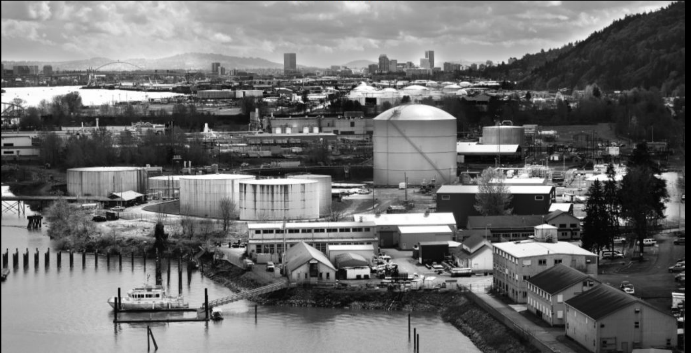
Portland, Oregon – CEI Hub