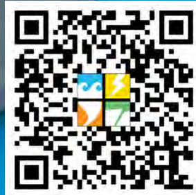
Natural Hazards Center