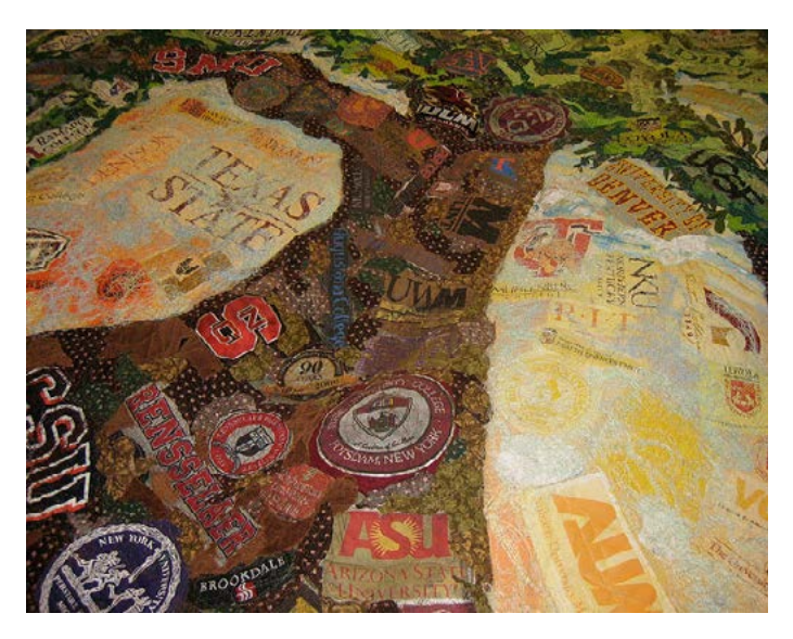
(Fig. 12) Live Oak by Gina Phillips, 2007. Tulane University displays this quilt in the faculty/staff dining room to recognize the many colleges and schools that hosted students after Hurricane Katrina