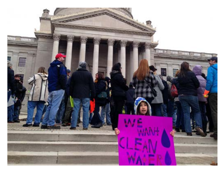
Protest West Virgina

Political capital has been underexplored in the disaster literature. Understanding how it works through two additional examples can help individuals, practitioners, and researchers expand their thinking about post disaster recovery. One example at the community level occurred in Charleston, West Virginia, in January 2014. That's when a Freedom Industries facility poured crude 4-methylcyclohexane methanol (MCHM)—an industrial chemical used in washing coal—into the Elk River near Charleston. It contaminated the drinking water of more than 300,000 people. Concerned citizens immediately sprang into action. Community groups such as People Concerned about Chemical Safety teamed up with local business owners in the affected towns. These local business owners had not been active