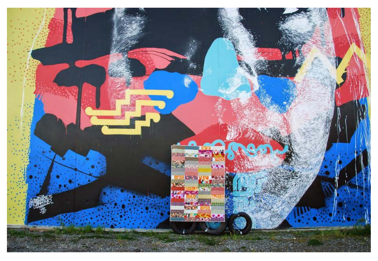
(Bottom Fig. 9) Sure to Rise shown against a wall mural in Christchurch © D.