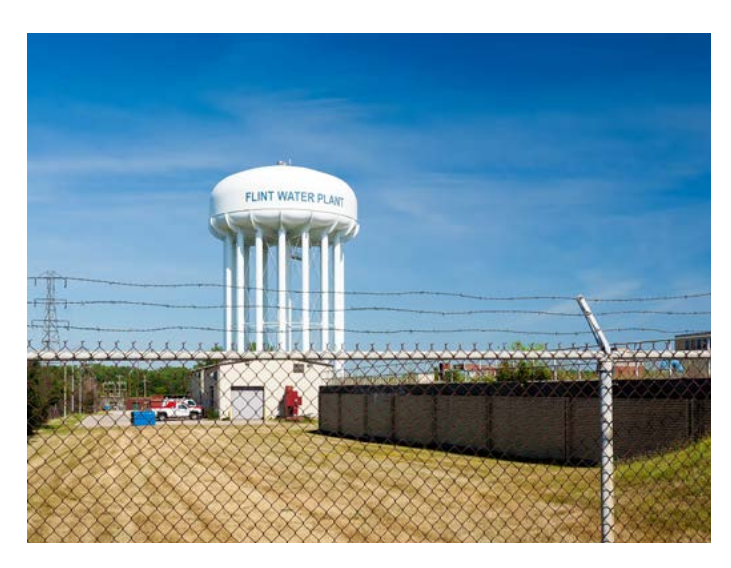
Flint Water Plant

mised health among children since 2014 when the water supply was switched.