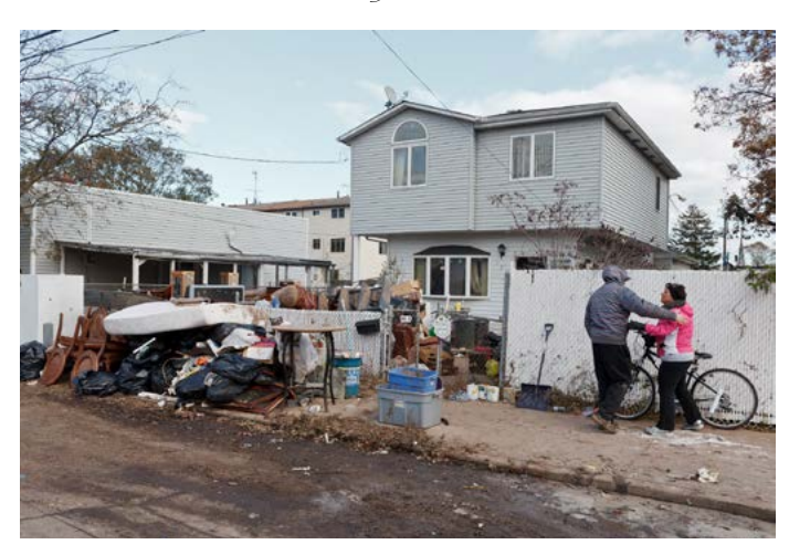
By Alexa Dietrich All photographs, Staten Island & Superstorm Sandy © November 2012, John de Guzman

WHEN SUPERSTORM SANDY touched down in New York City, October 29, 2012, communities were drastically underprepared for the storm's impact. The body count was eventually tallied at 159, with the highest numbers in the city coming from Queens and Staten Island. Overall damage costs have been estimated at $65 billion, second only to Hurricane Katrina (Rice and Dastagir, 2013) for a natural hazard event. For Staten Island, the most suburban and least densely-populated of the city's five boroughs, the damage and loss of life was particularly devastating. This disparity between the other boroughs was due, in part, to distinct underlying cultural factors.<sup>1</sup>