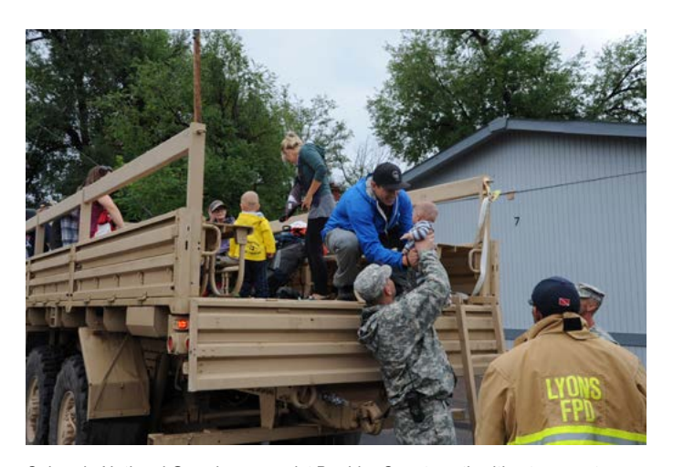
Colorado National Guardsmen assist Boulder County authorities transport evacuated residents of Lyons, Colorado to Longmont, Colorado. Sept. 13, 2013.

sues. Sensationalized media representations characterized Colorado's disaster-stricken communities as broken entities waiting for outside experts to "save" them. Depictions such as these can burden recovery efforts by leading outsiders to assume that locals are inept and incapable (Kato, and Passidomo 2015). Federal agencies have attempted to alleviate concerns about local involvement by incorporating requirements for stakeholder engagement into programs and protocols. For example, in a philosophical acknowledgement of these issues, FEMA has integrated the empowerment of local action in disaster management into its "whole community" approach (FEMA 2011).