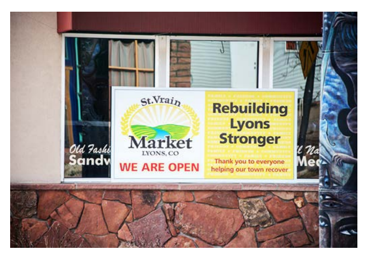
Lyons, Colorado, two months after the flood St. Vrain Market sign, November 16, 2013

In some cases, nonprofit groups took a similarly inflexible approach. For example, some organizations ignored community leaders' requests that they utilize local "cultural brokers" to assist with their efforts. Rather than drawing on local expertise to design their outreach efforts and service offerings in ways that were sensitive to residents' needs, some took a "one size fits all" approach. In one such situation, a nonprofit agency's door-knocking campaign, which was intended to deliver mental health services, trig-