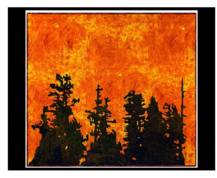
(Fig. 14) Firestorm by Marion Coleman

louisianafolklife.org/LT/Articles_Essays/main_Quilts_women_doc.html (accessed May 31, 2016).