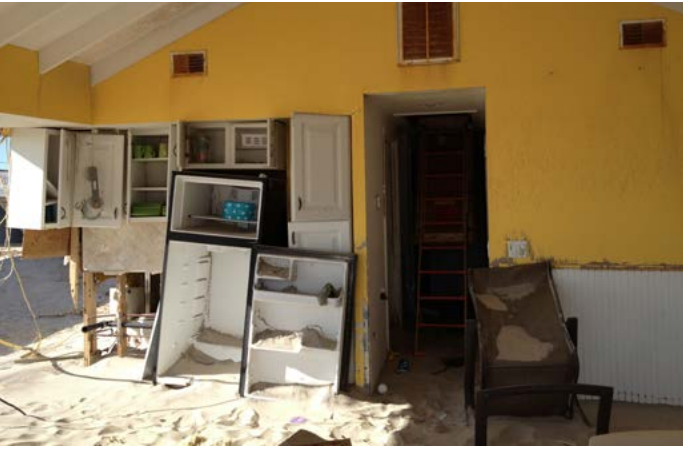
Jersey Shore after Superstorm Sandy