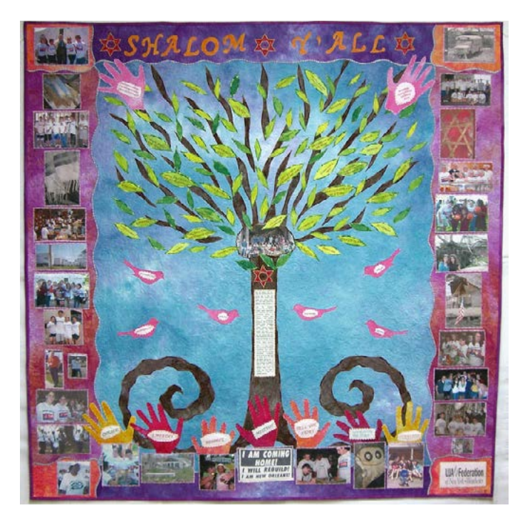
(Fig. 10) Shalom Y'All

from local institutions in their work, Tewassa volunteers regularly visit affected regions to deliver hand-crafted gifts. Every year a quilt is delivered, the first created by children drawing on cloth. It was delivered in the fall of 2011 to elementary school students from the Miyagi Prefecture Okawa school, where 70 of 108 students died when the school was destroyed. In 2015, four years after the Fukushima nuclear disaster, they presented a quilt of solidarity to a group of 60 survivors in Kazo City, a small community that still hosts 500 displaced people. Still searching for information about disaster aid and nuclear contamination, a spokesperson for the survivors stated, "We will live looking ahead" (fig. 6 and 7).