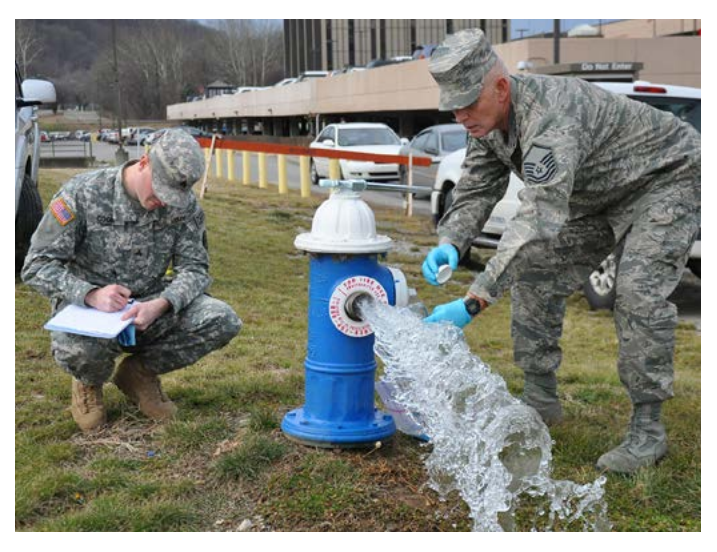
National Guard CSTs collect water samples in the wake of the Jan. 9 chemical spill.

as Daniel Aldrich (2012), have written about how social capital is necessary following a disaster. In Aldrich's work social capital refers to the ties between neighbors or other community members that enhance recovery. He cites the recovery following the 1995 Kobe earthquake in Japan as an example of a close knit community that was able to minimize migration out of the disaster affected area and actively participate in rebuilding because of their close ties. Aldrich also suggests that individuals first turn to their neighbors for post-disaster assistance, before the formal help system—the local, state, and national agencies with the purse strings—and that this connectedness enhances citizens' ability to recovery. Social capital therefore is the access to power and resources specifically from neighbors, informal organizations, or friends. On the other hand, political capital is the sustained interaction between government and these social networks. Drawing on social (people or resources around you) and political (people or resources typically out of reach in day to day life) capital highlights the necessity for individuals, and communities to connect with both each other and the formal help system to recover from disasters more effectively.