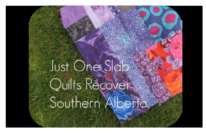
(Fig. 4) Just One Slab for Alberta Flood Relief @ Cheryl Arkison 2013

paigns of this sort in the immediate aftermath of a tornado or earthquake, especially but not exclusively if it is local.<sup>7</sup> After posting an appeal with directions, patterns, and deadlines, they generally try to forward along the stacks of donated quilts that will arrive at their doorstep. They may also post contact information about pre-determined collection points, shelters or volunteers knowledgeable about local needs and capacities.