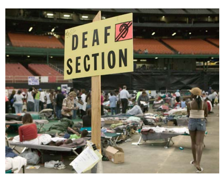
Deaf section for Hurricane Katrina evacuees at the Houston Astrodome. © Texas. September 2005, FEMA photo/Andrea Booher - Location: Houston, Texas

ify pre-existing buildings or curricula, rather to construct them in the first place for people with a diverse range of physical, sensory, and cognitive abilities.