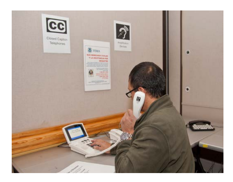
A FEMA Individual Assistance (IA) specialist demonstrates one of the communication devices that are available to residents affected by the Colorado Floods who may have communication difficulties at the Disaster Recovery Center in Estes Park, Colorado. © October 22, 2013 Photo by Patsy Lynch/FEMA