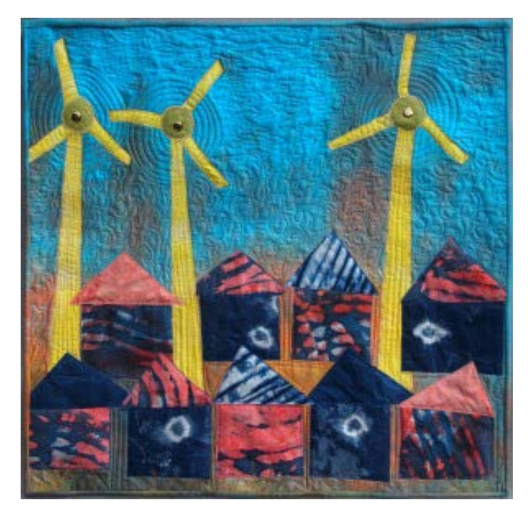
(Fig. 11) Wind to Enlighten by Barbara Eisenstein

Individual losses may also be recognized by disaster quilters. For example, when the 2012 earthquake in Christ-church, New Zealand, destroyed one woman's business, she created and sold a line of screen-printed tea towels with the logo Sure To Rise to earn some money to rebuild.