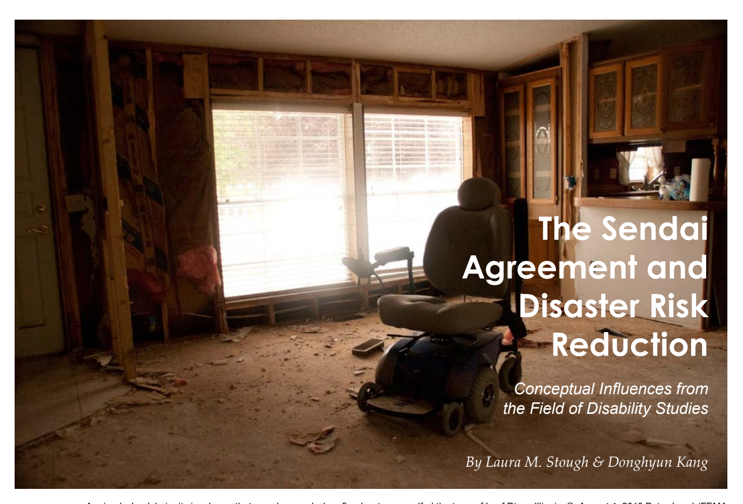
A ruined wheelchair sits in a home that was damaged when flood waters engulfed the town of Leaf River, Illinois.