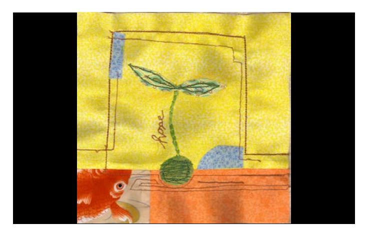
(Fig. 7) Hope. First block blogger Karen ever made, responding to Japan's 2005 Miyagi earthquake and tsunami © Karen 2005

Quilts are often constructed through virtual campaigns to create and distribute urgently needed functional bedding. These disaster-response campaigns arise spontaneously and quickly, one disaster at a time, facilitated by