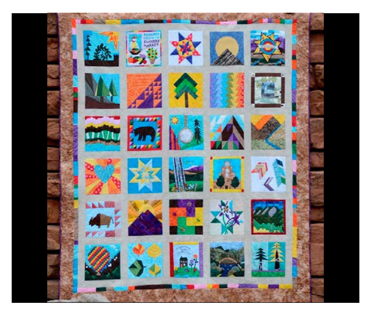
(Fig 2) Colorado Commemorative Flood Quilt © Lewis Geyer, Longmont Times-McCall 2015

deeply, is an artistic and humanistic response to environmental, technological and intentional disasters. These vivid expressions of the social fabric cover and comfort survivors, and also reflect important ideas and emotions when things fall apart. Like other people who speak through song, rap, poetry, murals, graffiti, art exhibits, books and movies, quilters give expression to human loss and renewal (Enarson, 1999, Webb, 2007; Weesjes, 2015). Whatever the context, quilting brings people, especially women, together, building community solidarity and enriching the lives of those who give as much as those who receive. Disaster recovery and resilience are surely supported by these beautiful gestures of solidarity and support, including the many 9/11 quilts that traveled the nation for years and now grace the nation's capital.<sup>4</sup>