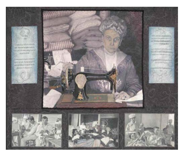
(Fig. 3) Women Helping Others by Jennifer Day. Legion of Loyal Ladies came together to make hospital bedding for those afflicted by the 1918 influenza ©

Quilters are tightly networked, which is important in disaster communication and collaboration. They often work with others through geographically-based guilds or networks, and may be connected through social media across many national borders. Their strong community bonds as well as their artistry and commitment to disaster relief volunteerism position them as significant partners