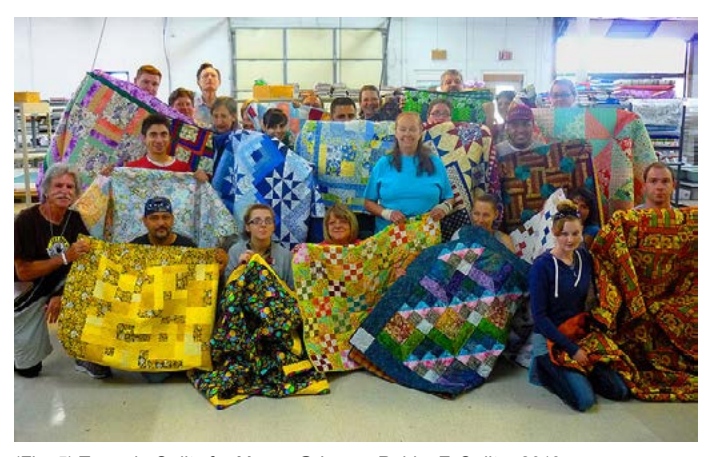
(Fig. 5) Tornado Quilts for Moore @ Luana Rubin, E-Quilter 2013

Disaster quilt campaigns engage quilters in the collective work of remembrance, protest or commentary, speaking through their craft to console those who suffer. Writing from Australia after massive bushfires in 2009, contributors to the 59-block Mudgegonga Community Quilt explained how the colors chosen reflected the local terrain and the earth blackened by fire, explaining: "Two precious lives were lost; seventeen homes destroyed; cattle, sheds, fences, tractors, cars, gardens and plantations all destroyed. From the midst of this devastation, a renewed and strengthened community gathered and supported each other with an outpouring of love, care, kindness and compassion. We were overwhelmed with the generosity of our community and our country. The quilt depicts the individuality of the