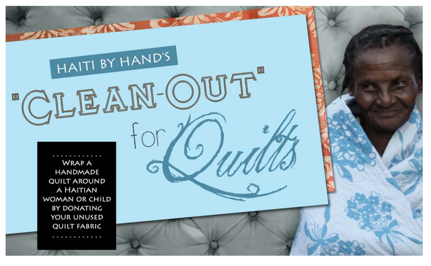
(Top Fig. 8) Haiti By Hand's Clean-Out for Quilts