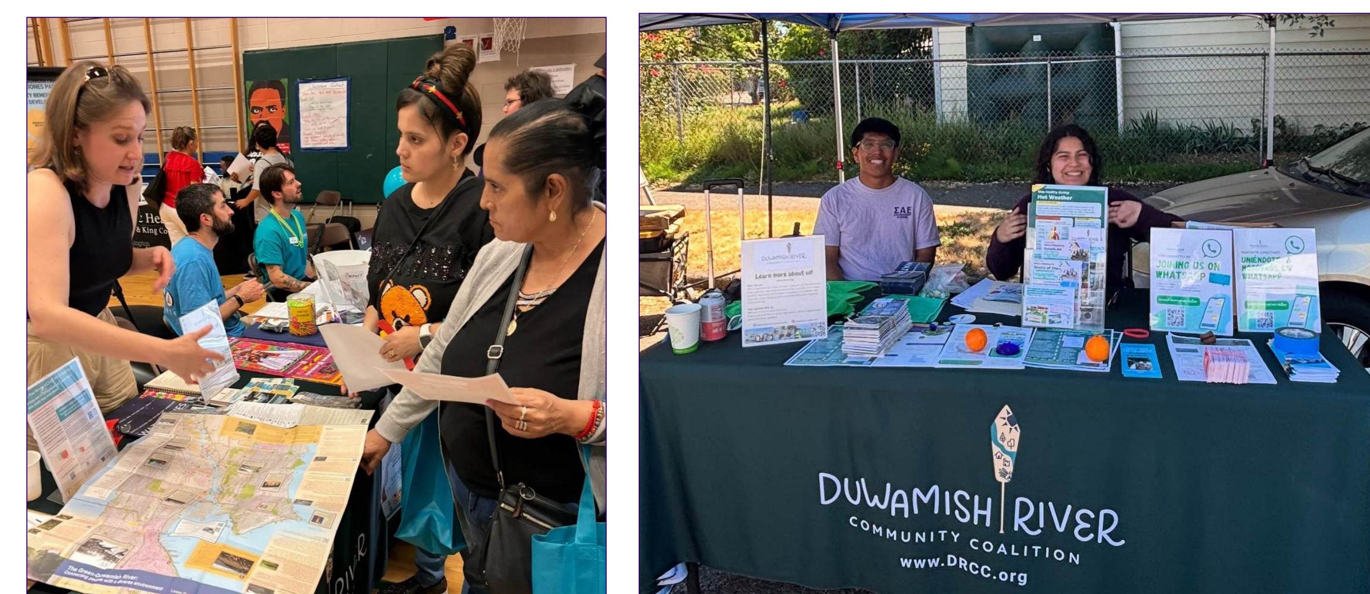
The project team engaged South Park residents at community events, to educate neighbors on the root causes of flooding and to gather feedback on possible flood adaptation strategies.