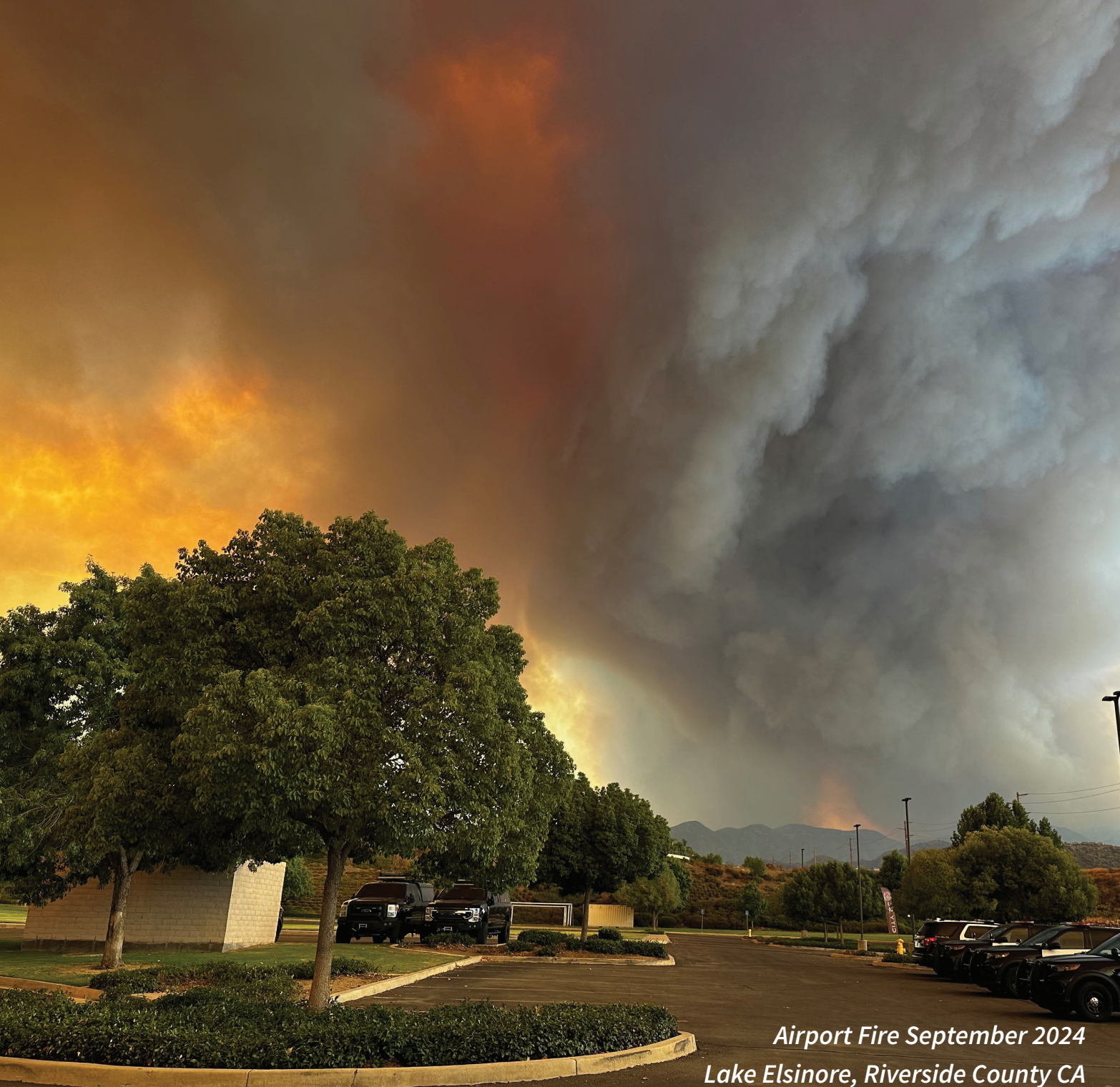
Airport Fire September 2024 Lake Elsinore, Riverside County CA