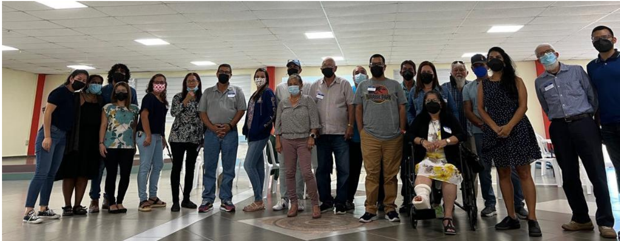
Image: Project Team Members and Community Leaders in Corcovada.