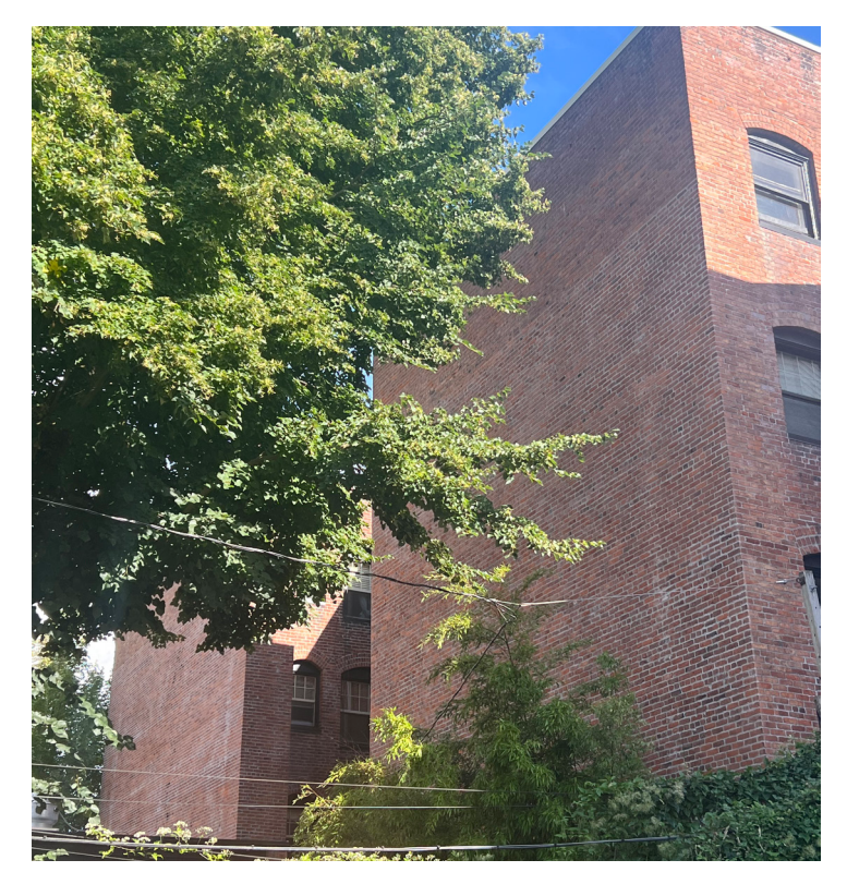
An unreinforced masonry apartment building in Portland, OR. Photo credit: Sarah Mercurio, August 30, 2023.